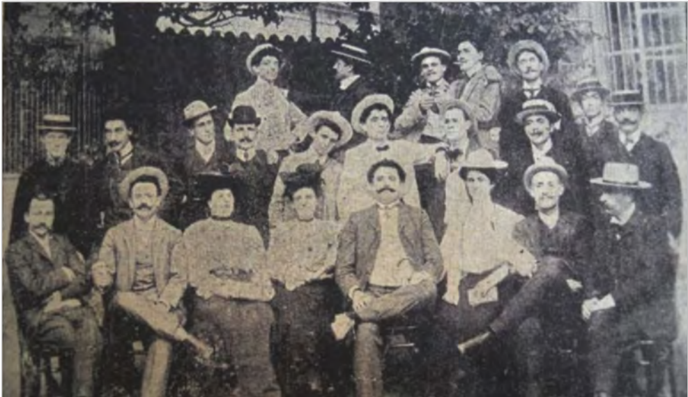
Fig. 1: The Grigoriu Company, first decade of the XXth century