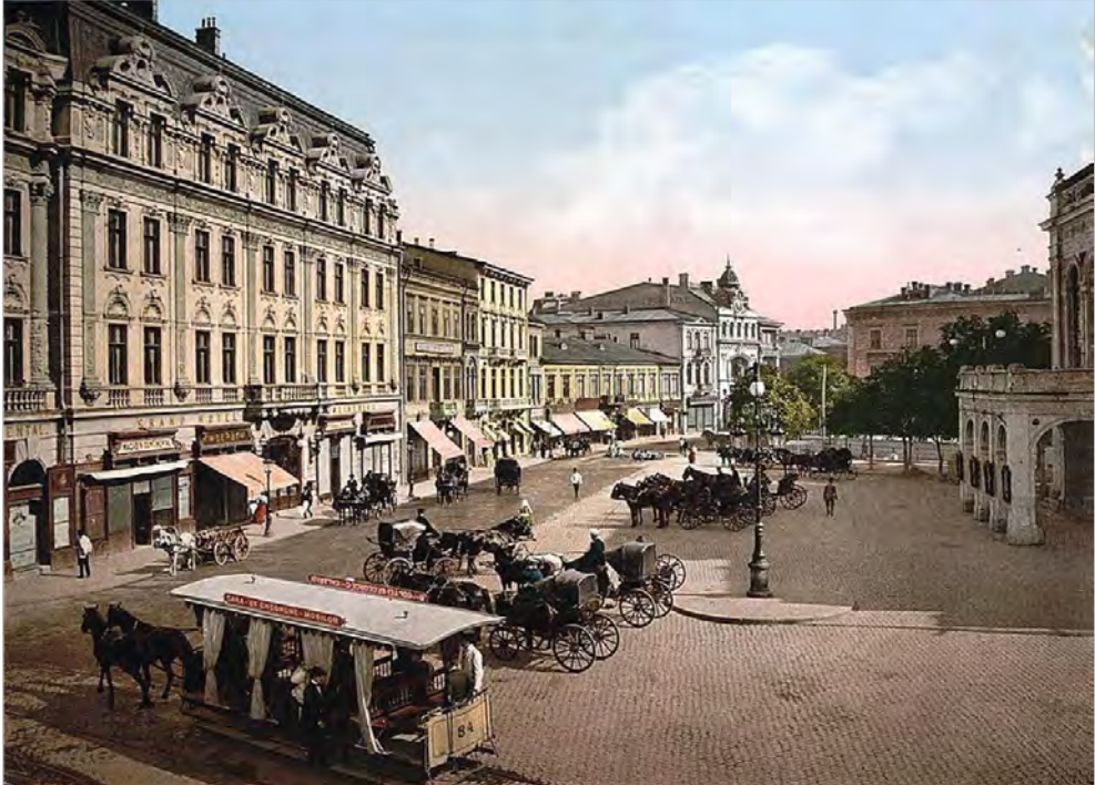
Fig. 7: The Square in front of the National Theatre with the Oteteleşanu Terrace in the background, on the right, 1915.