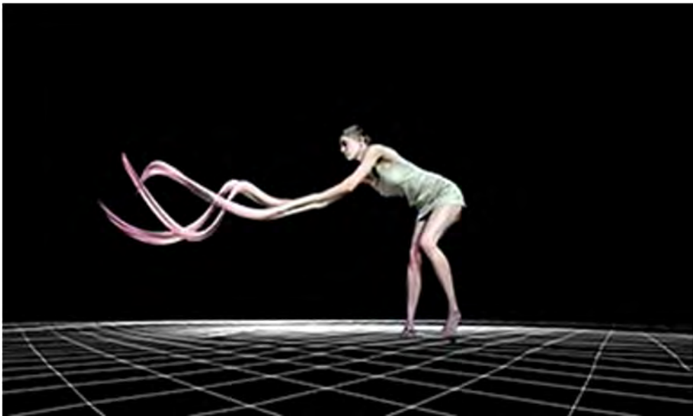
Figure 1: Klaus Obermeier – Le Sacre du Printemps (2006)

A very good illustration of the anxieties generated by the effects of digital technologies on human life in the information age and the dynamics of their control is Le Sacre du Printemps , an interdisciplinary artistic production by Klaus Obermeier, an intermedia artist.