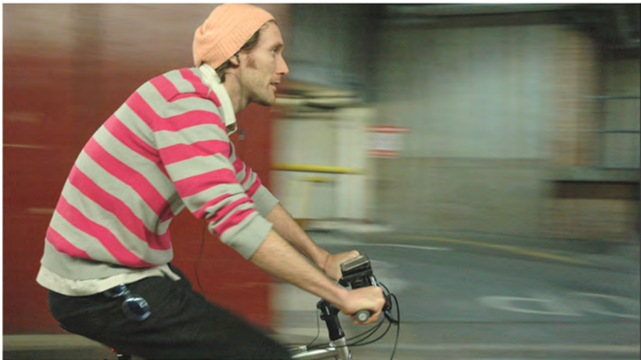
Figure 11: Blast Theory – Rider Spoke (2007)

Once in the physical proximity of the place where the responses of other participants were recorded and submitted, the participants can access their content, but only with the equipment received. The participants are both the public and the creators of the content of this project, which is currently available on the web page, so that although it is built according to the classic mixed reality performance model, the performance experience can also be seen in the form of a digital artefact.