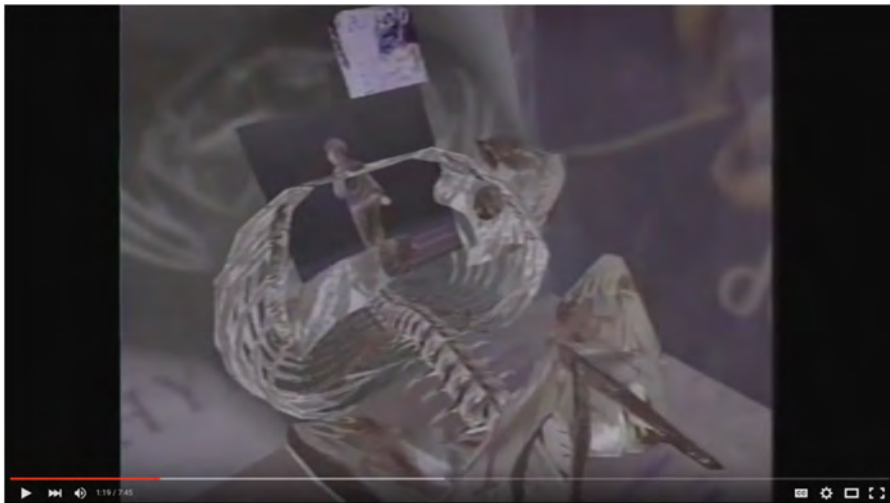
Figure 4: Gromla – Dancing with a Virtual Dervish (1993).

When the performer is transposed through digital technologies and performs in a digitally built virtual reality space, we are dealing with an immersive performance . Stereoscopic glasses, body sensors, digital gauntlets - are interface elements that collect motion-related data that your computer uses to interfere with virtual space.