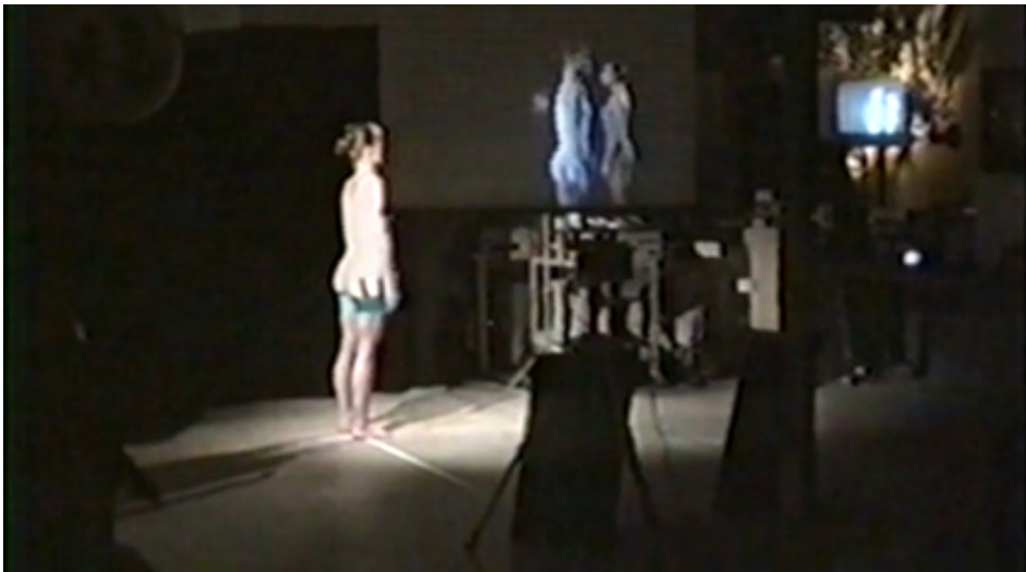
Figure 5: Troika Ranch – An Adjacent Disclosure (1991)

In 1991, Troika Ranch produced the performance An Adjacent Disclosure . The dancers were performing live in completely different locations, though not so far apart from each other. The captured images were projected onto a screen in which the two dancers seemed to dance together, though they could not at all touch it.