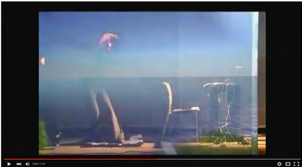
Figure 7: Aki Anne II (2007-2008)